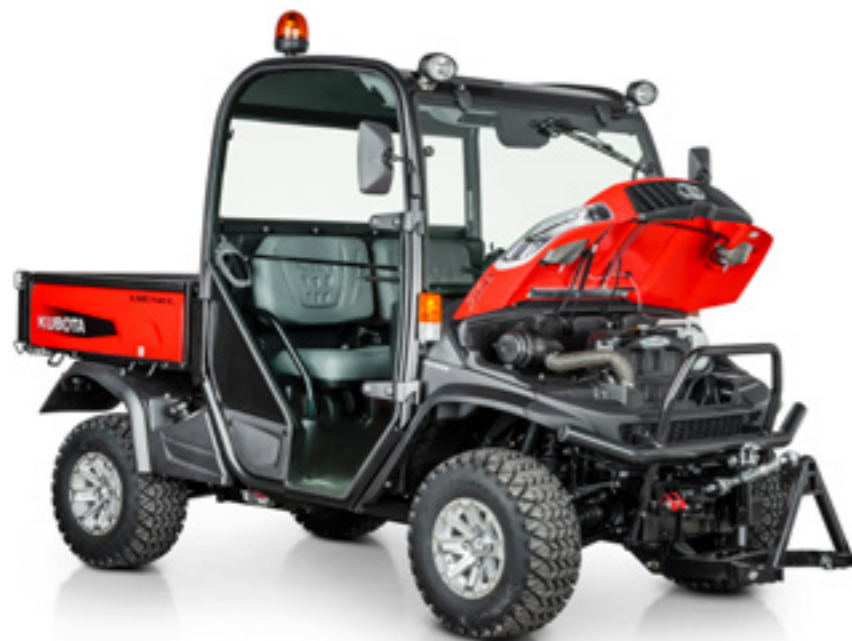
Front-linkage not available in the UK